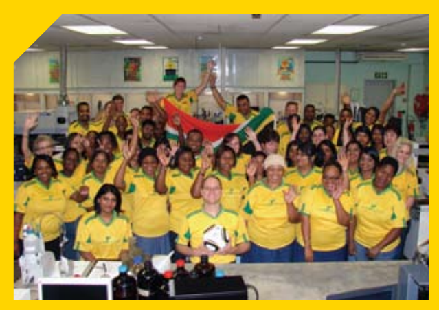
Pinetown laboratory and head office