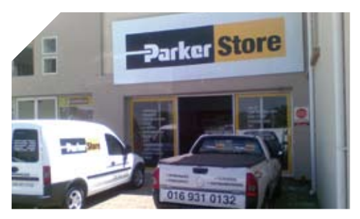
The new WearCheck depot at Parker Store Vaal in Vanderbiljpark

A sample collection service is also available.