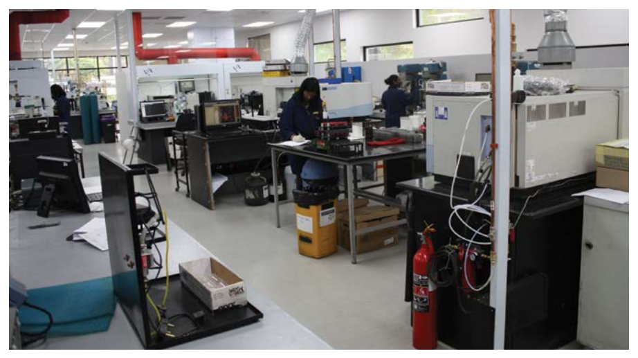
A view of WearCheck's new Durban laboratory, which was opened in November 2020 and is now the hub of the company's Africa-wide service offering.

Along with this acquisition, WearCheck also inherited a technical inspection and compliance division, which is accredited to certify the safety of hoist systems, fans, electrical panels and other critical mining systems. "This 'piece' has no obvious links to