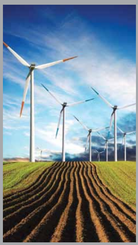
Product code: WWTS (standard kit) | WWTA (advanced kit)