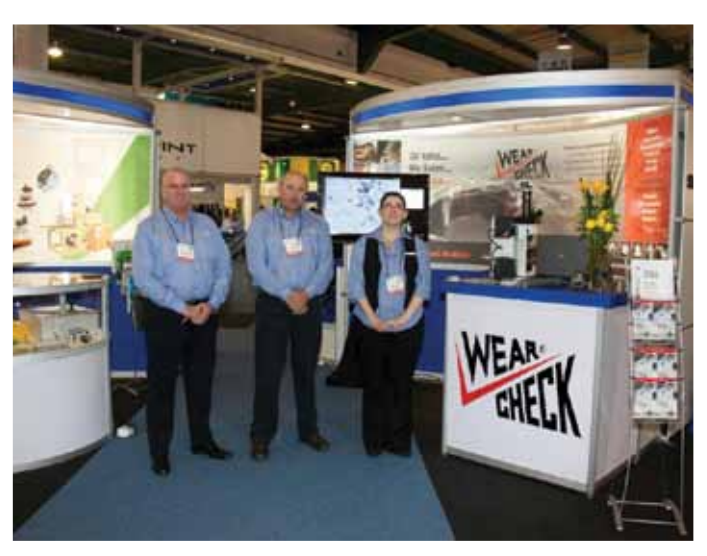
WearCheck's stand at the 2012 Electra Mining expo was a popular one

WearCheck's stand at the recent Electra Mining expo was visited by many guests. It was a great opportunity for the WearCheck team to catch up with familiar faces, and also to meet new customers.