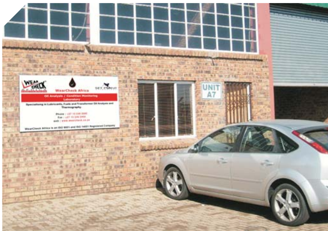
WearCheck's new laboratory in Middelburg, Mpumalanga

The Middelburg Lab will be incorporated into WearCheck's quality and environmental management systems with a view to obtaining ISO 9001 and 14001 registration as soon as possible.